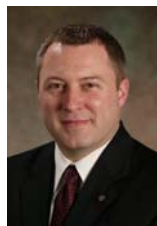
Rotarian of the Week